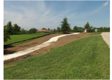
New cement hiking/biking trails at Mozingo Lake.