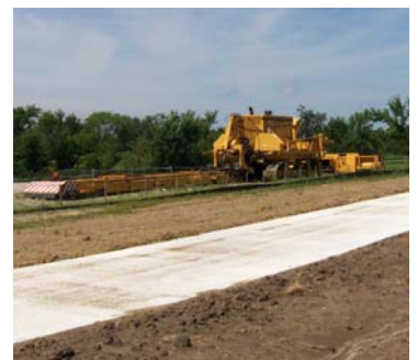
Construction at Mozingo Lake Golf Course.