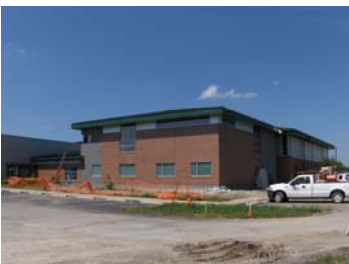
New addition to the Maryville Community Center.

Visit our website at www.maryville.org to view Current Job Openings with the City