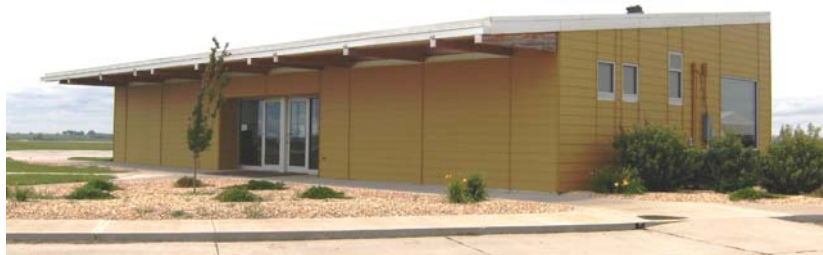
Northwest Missouri Regional Airport Terminal Building—Constructed in March 2007 with federal and state grant funds

All of these additions should help attract new businesses and new industries to Maryville. One of the many aspects of a community that businesses look for is the accessibility of the town from their headquarters. We believe this has been accomplished by all the recent renovations and hope to see our hard work pay off. On September 20, 2009 Northwest Missouri Regional Airport will be having an open house and fly-in to show off the new improvements to the facility and possibly to offer flights to visitors at the airport facility. The public is invited and encouraged to attend.