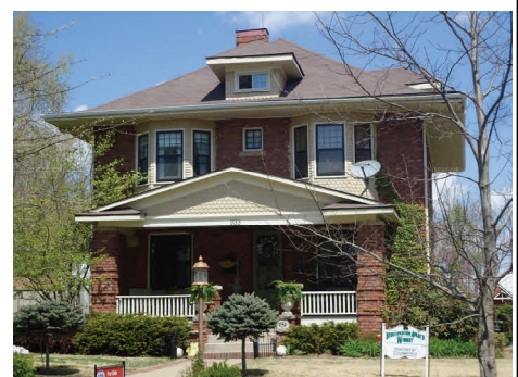
Ron Darnell—Winner April 2011

Please email three (3) different pictures of the property to jbrown@maryville.org . If you are nominating it for rehabilitation, please include a before and after picture.