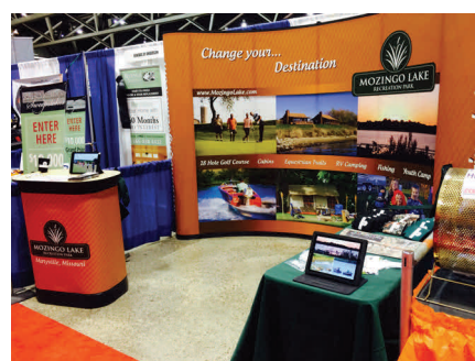
Mozingo Booth at Trade Show

Mozingo staff has attended outdoor recreation trade show sin Des Moines, Iowa and Kansas City over the past couple of weeks. Crowds have been excellent as well as interest in Mozingo as we continue to introduce Mozingo, along with the Maryville community, to interested guests. The next event will be the Kansas City Golf trade show the weekend of February 13th. This will be the first time that Mozingo has attended this event and will be an excellent opportunity to introduce the golf courses and Mozingo to a large group of dedicated golfers.